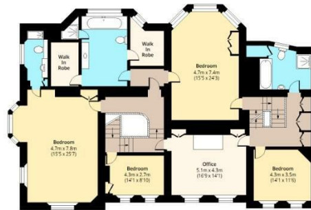
First Floor Approx. 225.38 Sq. meters (2426 Sq. feet)